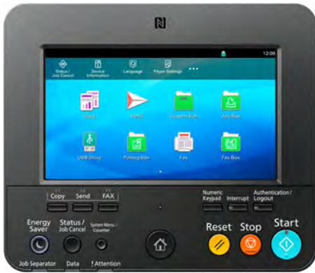
TASKalfa 508ci / 408ci / 358ci control panel